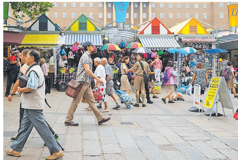
■ Some of the Norwich landmarks that will feature in the En Plein Air art competition. Above, Norwich Castle, below, the market, and top left, Pull's Ferry.