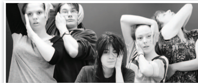
■ Total Ensemble Theatre Company's In Love And War, one of the shows at the Hansells Hostry Festival at Norwich Cathedral's Hostry, below.