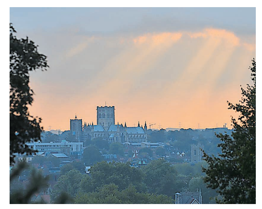
The city's Roman Catholic cathedral is also to be featured.